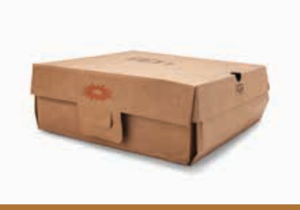
COUNTERFEIT BOX WITH OLD SUN LOGO